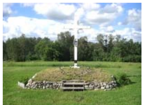
The Violette Settlement Cross