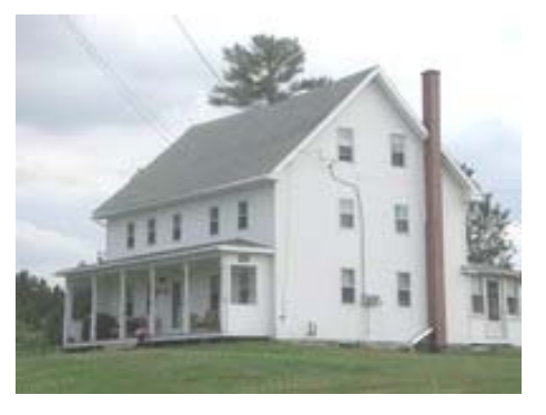
The Violette House, on Violette Street, has the original log house within the structure.

The photos below show just a few of the many features associated with the Violette family that you will be able to locate through our maps.