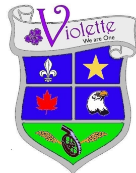
The Violette Family Association Coat of Arms, adopted in 2014.

Contact a Board member if you are interested.