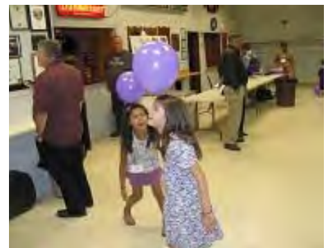
Kids having fun at Reunion 2011