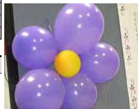
A balloon violet decoration from Reunion 2011.

Keep your email address up-to-date with us!