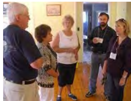
"Cousins" visiting at Reunion 2011

If you have an email address you can save the Association a lot of money by letting us send newsletters by email! Give it to us today.