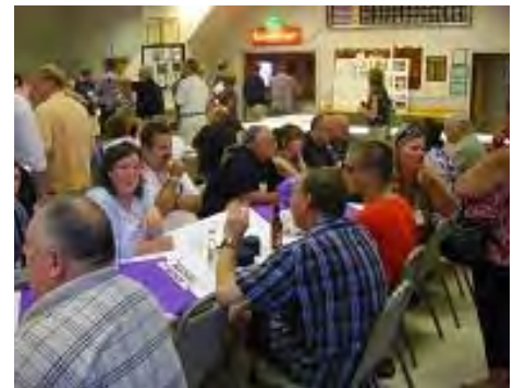
People at table at Reunion 2011