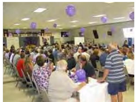
Making announcements at the reunion hall Reunion 2011

Make sure we have your current email address on file.