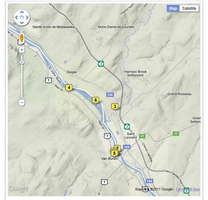
Rings are at 10-, 15-, 20-, and 25-mile radius around Van Buren Double-click to zoom map using that point as new center, use the mouse wheel to zoom in or out, or use the pan and zoom controls at upper left. Use the options at upper right to switch between roadmap view and satellite view.

Violette Family Reunion 2011 Maps Markers such as indicate clusters of places; the number shows how many. Zoom in to see the individual places.